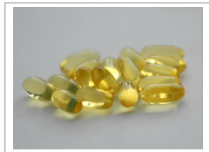
For heart health, fish oil pills not the answer: study