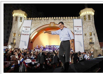
As other polls show tight race, Gallup stands apart