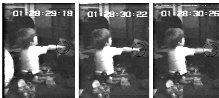
Figure 1. An example of a held sign

Holds. A hold was coded when the final articulation of the gesture remained in the same handshape and overall position for a minimum of 10 frames (there was